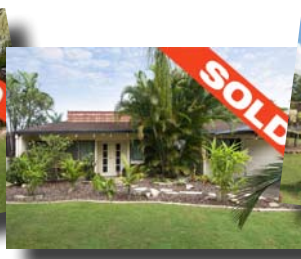
8 Cilento Street, McDowall