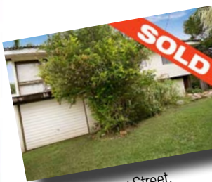
3 Disney Street, Stafford Heights