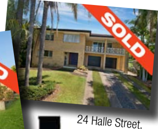
24 Halle Street, Everton Park