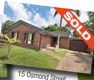
15 Osmond Street, McDowall