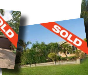
24 Arlington Drive, Arana Hills