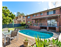
14 Poitier St, McDowall