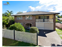
8 Gleason St, McDowall