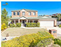
3 Burlinson Cl, McDowall