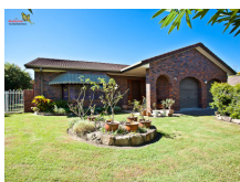
47 Parton St, Stafford Heights