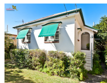
11 Figgis St, Kedron